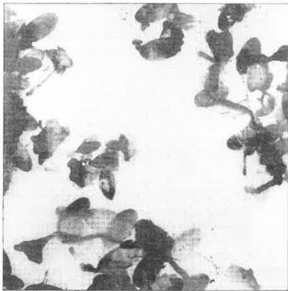
Top: Nellie King Solomon, Smokey Whahdnt Bright , 2002, ink, Mylar, 8' x 8'; bottom: Is , 2002, ink, Mylar, 8' x 8'.

life at the cellular level, as if one were watching through an enormous microscope the magnified, pulsating, never-ending process of birth, death and regeneration.